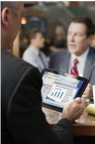
Simply click the “Join” button to participate, no matter where you are